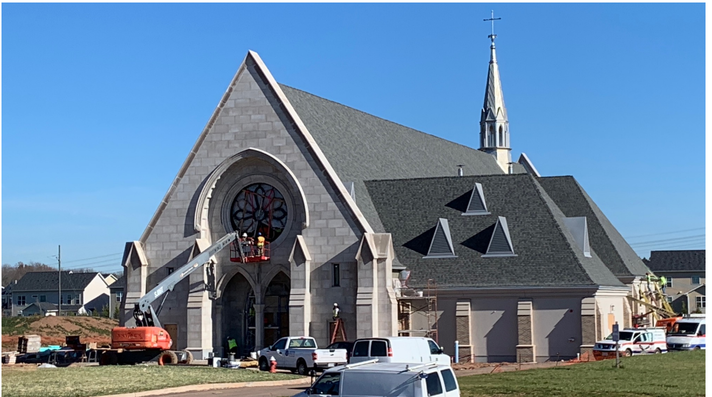
VIEW FROM SOUTH WEST CORNER