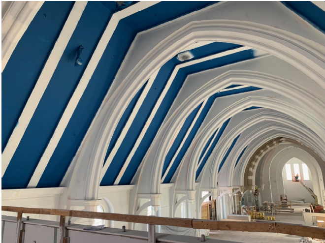
FINAL PAINT AT NAVE CEILING