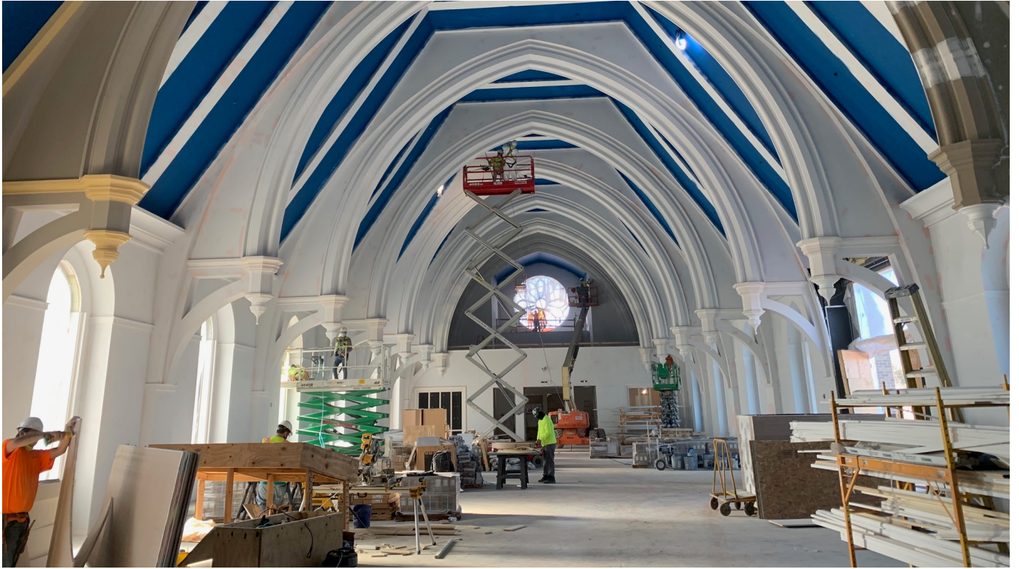
NAVE FACING WEST