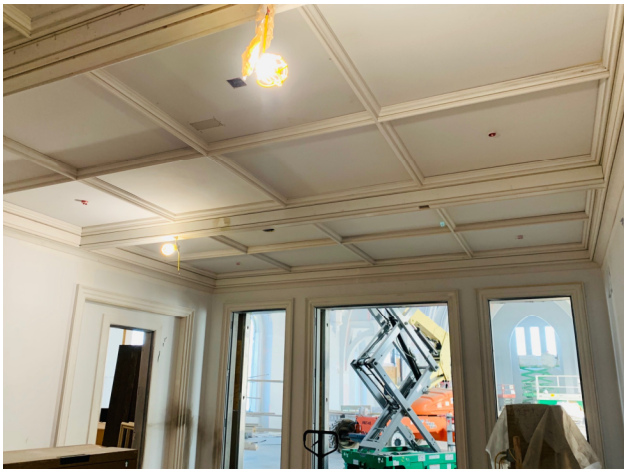
COFFERED CEILING AT NARTHEX