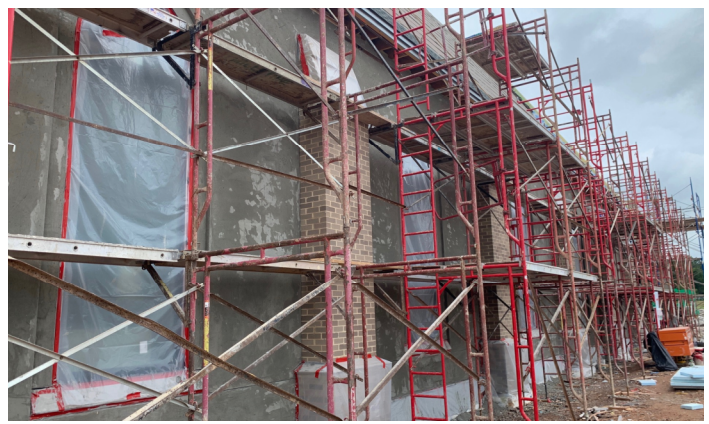
STUCCO AND GRANITE INSTALLATION AT NORTH ELEVATION