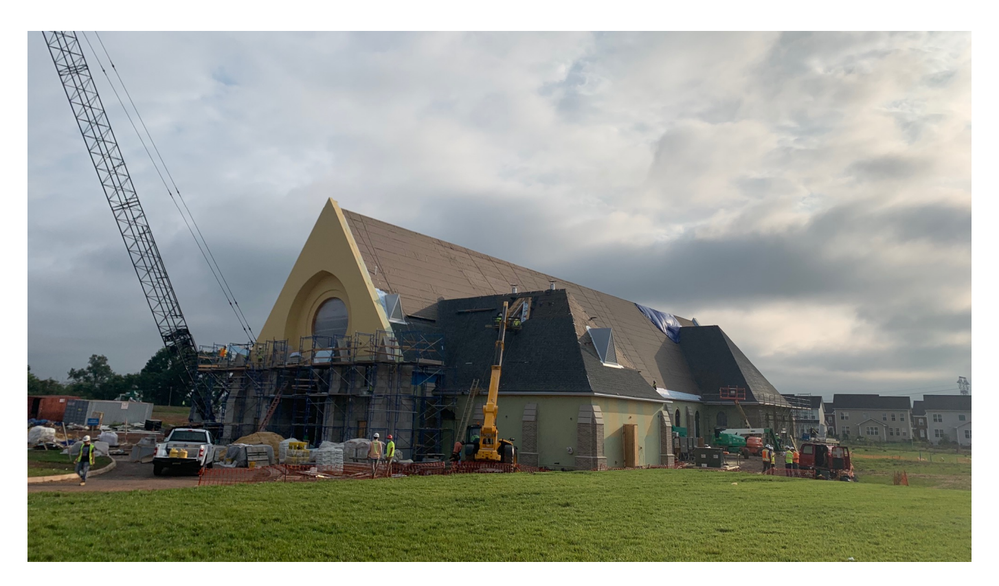
VIEW FROM SOUTH WEST CORNER